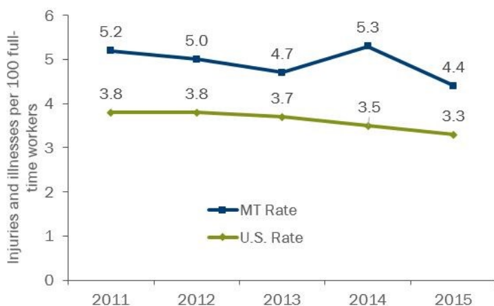
Rate of non-fatal injuries and illnesses per 100 full-time workers in private Accommodation and Food Services industry, Montana and U.S., 2011-2015

In 2015, there were 4.4 estimated cases of non-fatal injuries and illnesses per 100 full-time workers in Montana's private Accommodation and Food Services industry, which was higher than the national rate of 3.3 cases per 100 full-time workers.