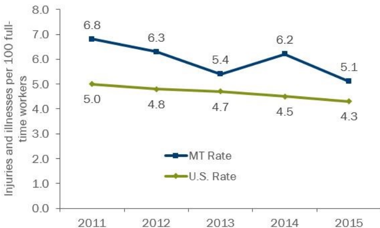
Rate of non-fatal injuries and illnesses per 100 full-time workers in private Health Care and Social Assistance industry, Montana and U.S., 2011-2015

In 2015, there were 5.1 estimated cases of non-fatal injuries and illnesses per 100 full-time workers in Montana's private Health Care and Social Assistance industry, which was higher than the national rate of 4.3 cases per 100 full-time workers for this industry.