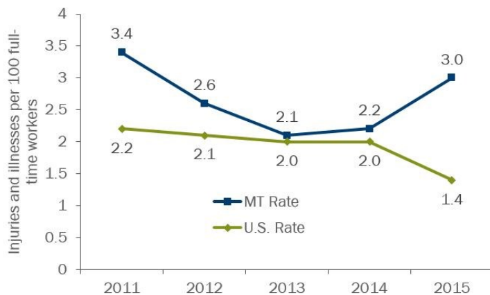
Rate of non-fatal injuries and illnesses per 100 full-time workers in private Mining, Quarrying, and Oil and Gas Extraction, 2011-2015

In 2015, there were 3.0 estimated cases of non-fatal injuries and illnesses per 100 full-time workers in Montana's private Mining, Quarrying, and Oil and Gas Extraction industry, which was higher than the national rate of 1.4 cases per 100 full-time workers in this industry.