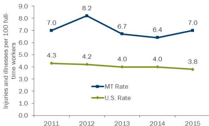
Rate of non-fatal injuries and illnesses per 100 full-time workers in private Manufacturing industry, Montana and U.S., 2011-2015

In 2015, there were 7.0 estimated cases of non-fatal injuries and illnesses per 100 full-time workers in Montana's private Manufacturing industry, which was higher than the national rate of 3.8 cases per 100 full-time workers in this industry. Montana's private Manufacturing industry has consistently higher rates of injury than the industry nation-wide.