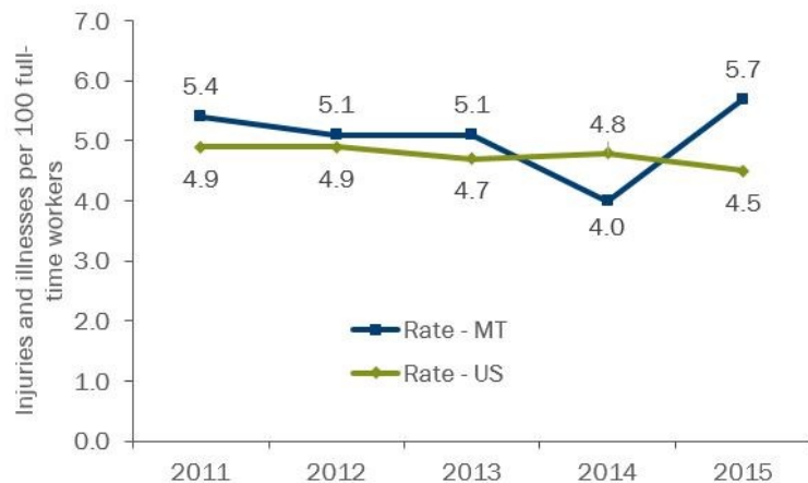
Rate of non-fatal injuries and illnesses per 100 full-time workers in private Transportation and Warehousing industry, Montana and U.S., 2011-2015

In 2015, there were 5.7 estimated cases of non-fatal injuries and illnesses per 100 full-time workers in Montana's private Transportation and Warehousing industry, which was higher than the national rate of 4.5 cases per 100 full-time workers for this industry.