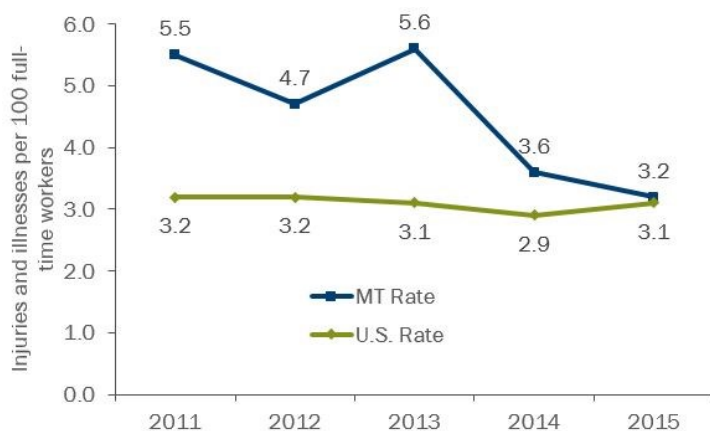
Rate of non-fatal injuries and illnesses per 100 full-time workers in private Wholesale Trade industry, Montana and U.S., 2011-2015

In 2015, there were 3.2 estimated cases of non-fatal injuries and illnesses per 100 full-time workers in Montana's private Wholesale Trade industry. The national rate of non-fatal injuries and illnesses for private Wholesale Trade industry was 3.1 cases per 100 full-time workers. Montana's private Wholesale Trade industry has seen a recent decline in rates of injury in this industry sector.