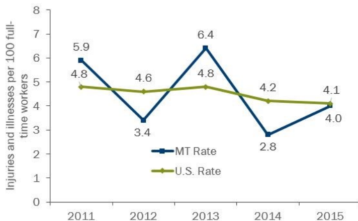
Rate of non-fatal injuries and illnesses per 100 full-time workers in private Arts, Entertainment, and Recreation industry, Montana and U.S., 2011-2015

In 2015, there were 4.0 estimated cases of non-fatal injuries and illnesses per 100 full-time workers in Montana's private Arts, Entertainment, and Recreation industry. The national rate for this industry was 4.1 cases per 100 full-time workers.